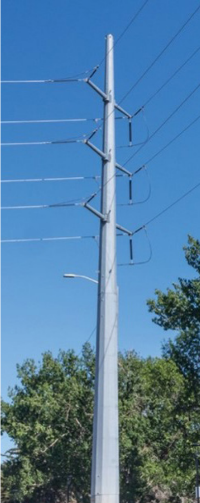
Self-Supporting Steel Monopole

The existing Overhead Replacement transmission structures range from approximately 15 to 26 meters in height and run approximately 510 meters in length.