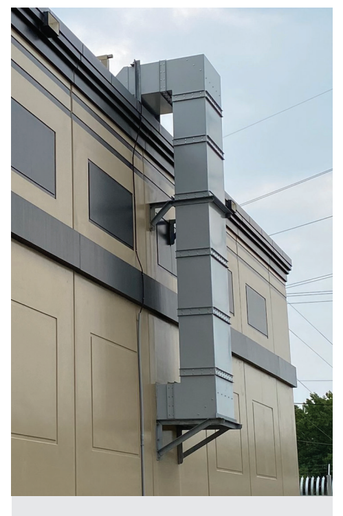
Example of Plenum Vent