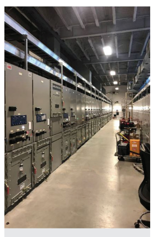
Example of Proposed Switchgear