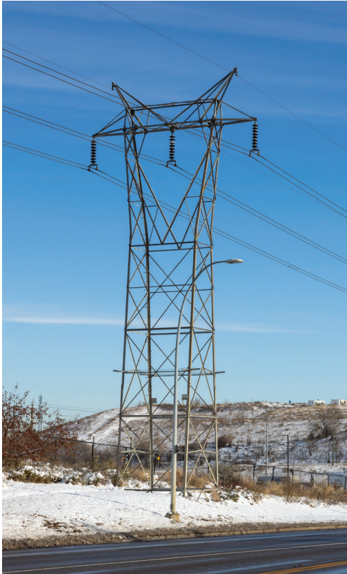
Example of a Structure to be Removed (Lattice Structure)

The existing steel lattice structures, steel self-supporting monopoles and wood poles to be removed range in height from approximately 19 to 32 meters. The new steel self-supporting monopoles are expected to range in height from approximately 20 to 30 meters as required to meet design and safety standards.