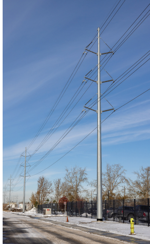
Example of a New Structure (Double Circuit Self-Supporting Monopole)

Double circuit: Two transmission lines on the same transmission structure, with each single circuit made up of three sets of conductors.