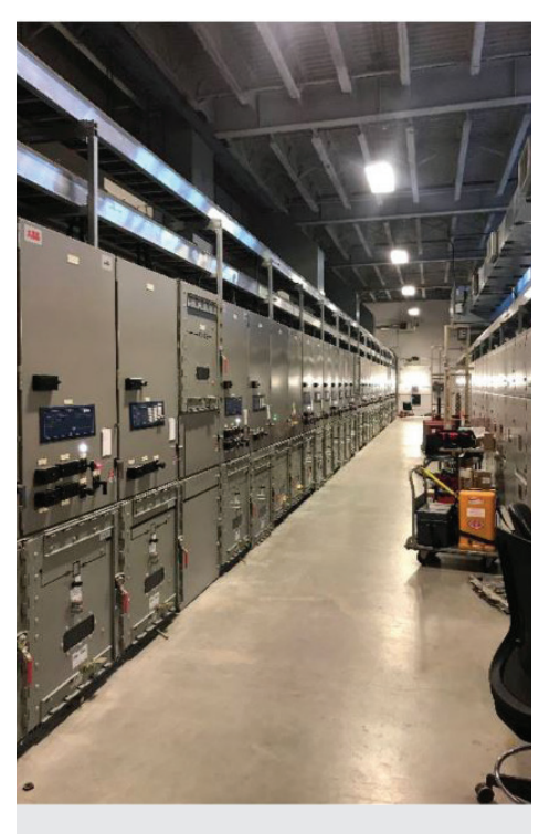
Example of Proposed Switchgear