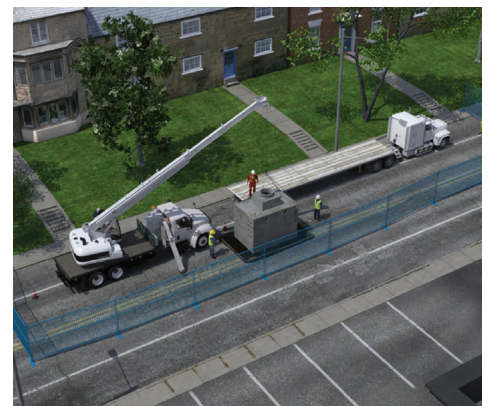
Maintenance Hole Placement