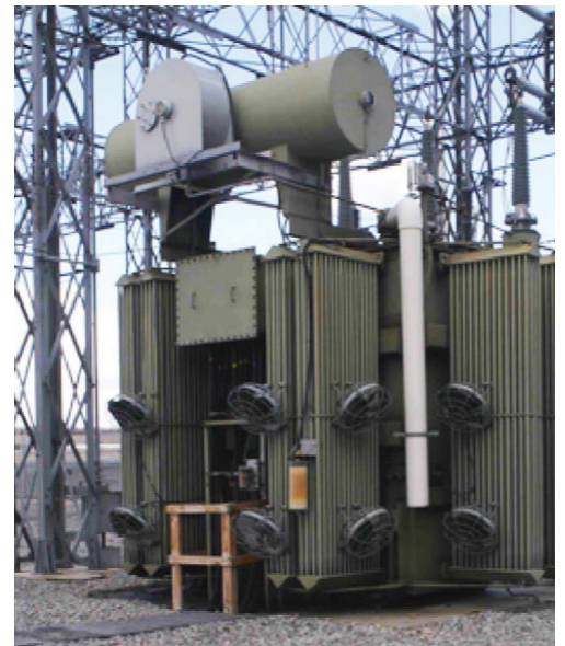
Example of Transformer

Transformer: Equipment that reduces the high voltage electricity coming in through transmission lines to a lower voltage suitable to send through distribution lines.