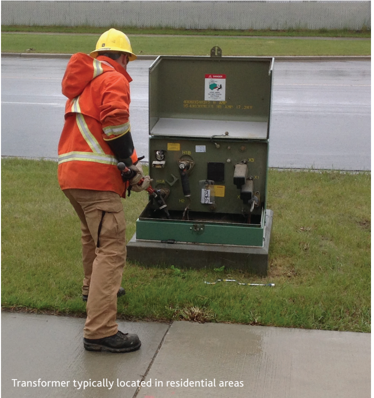
Transformer typically located in residential areas