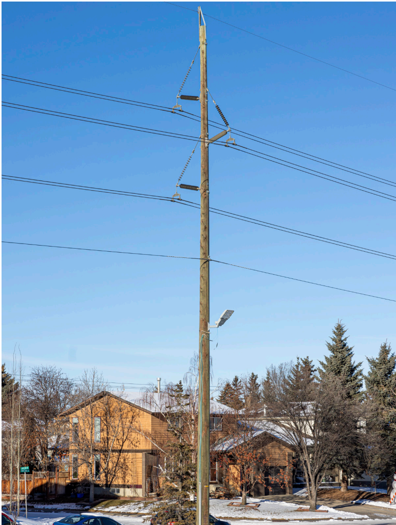
Example of a Wood Pole

The new wood poles will be approximately 20 meters in height, and the existing wood poles are approximately 17 meters in height.