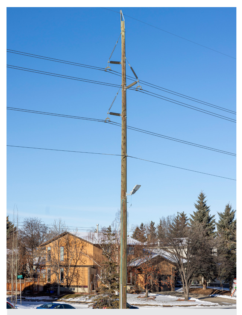
Example of a Wood Pole

The new wood poles will be approximately 20 meters in height, and the existing wood poles are approximately 17 meters in height.